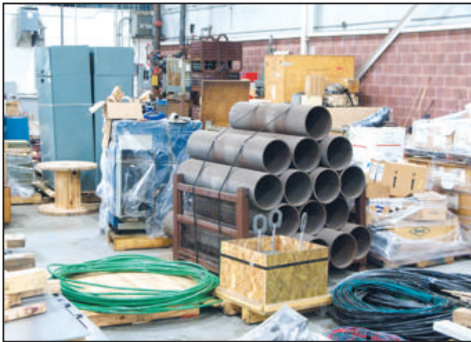
Fig. 9. Guess what these steel tubes will ultimately turn into?