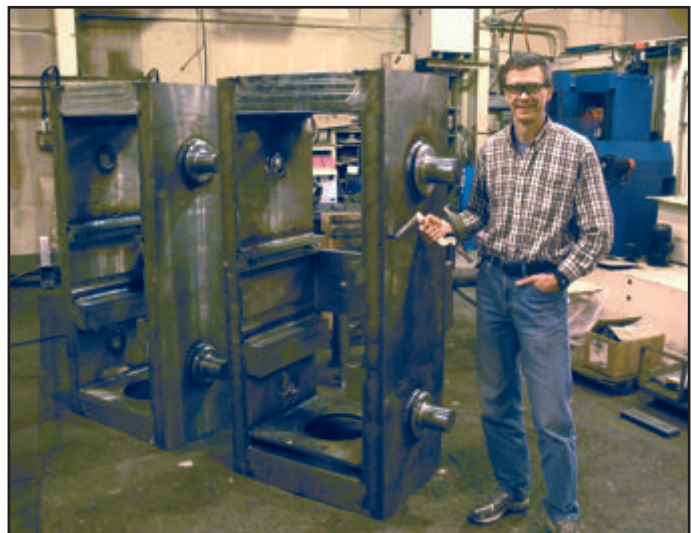
Fig. 13. This photo shows the range of scale of the designs and processing of the projects that cross Kevin's desk.