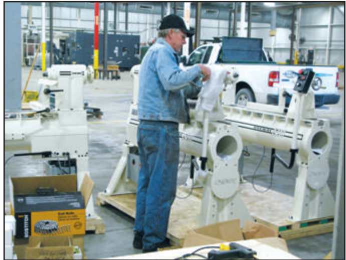
Fig. 11. Each lathe is built to order and the final assembly has already been moved to the new facility.