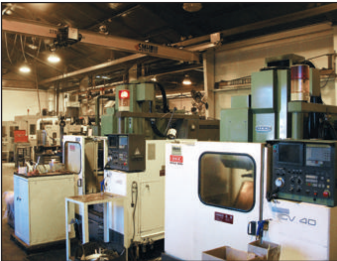
Fig. 3. Oneway Manufacturing is really a marketing operation of Perth Precision, a contract machining company.