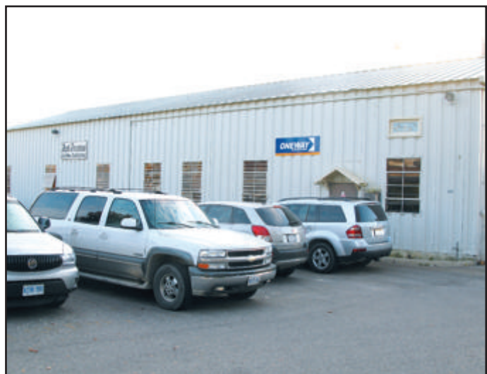
Fig. 1. The Oneway Manufacturing Company is located on a quiet street in Stratford, Ontario, Canada.

When I visited in October 2010, the company was in the throes of moving from its current location to a new, much larger building. The move was being done on the fly without the luxury of shutting down any of the operations or interrupting production; that is quite an undertaking. By the time you read this, the company will have moved to its new location. The new site offers plenty of space for the current operations with room for growth. Currently, part of the new building is being leased out until the company's own operations require the space. Even though it has been, and is, continually growing, they still keep it a "small family" business. If you call, you are likely to have the phone answered directly by one of the Clay family, and if not, you'll be able to speak to one of them just by asking.