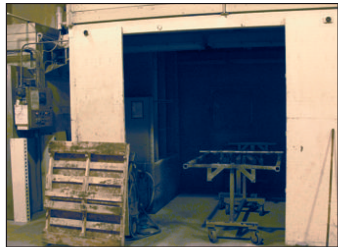
Fig. 7. The Oneway products needing powder paint coating are completed on-site.