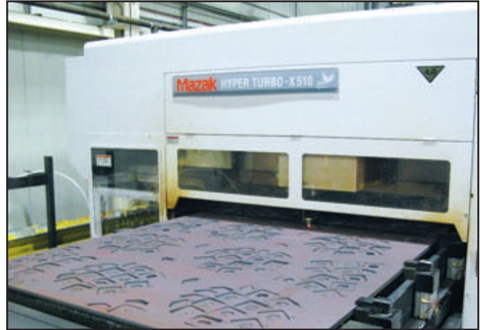
Fig. 5. Typical to most machining companies, laser-cutting operations are widely used because of their versatility.