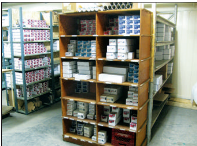
Fig. 10. The new building is already being set up to do fulfillment of accessory orders.