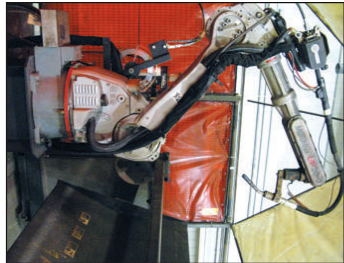
Fig. 6. Robotic welding is a key process in the fabrication of the Oneway tube construction lathes and is much of their contract work.