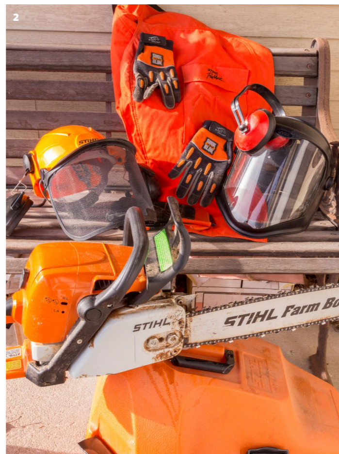
1 My stable of chain saws. Since I don't tackle very large work, my Stihl is large and powerful enough for my needs. The others fill the smaller and quicker cutting or indoor cutting. 2 As important as the saw and your training is your PPE. Here's mine. Protective helmet (face and ears too), chaps, gloves, and extra PPE for the non-cutting helper if needed.

comfortable with, but I use a combination hard hat helmet with a wire mesh face mask and integral earmuffs. Along with my head, face, and ear protection, I have a pair of chain saw chaps and jacket, and cut resistant, vibration dampening gloves. It all stores nicely in a duffel bag next to the saw. Some advice wanted or not. Buy for value and not for price if you can swing it. The big box stores are unable to help you with any saw problems. Buying from a dealer who carries the more professional saw products, while pricier, will pay dividends when you have any issues. I have never been unhappy with my local Stihl dealer. That said, I have friends who run professional tree services that use other pro brands and are happy with them. The usable lifetime on my saws is far longer than on me so spending a few extra bucks was worthwhile. Take your time and spend your money to wisely get what fits your needs and has support.