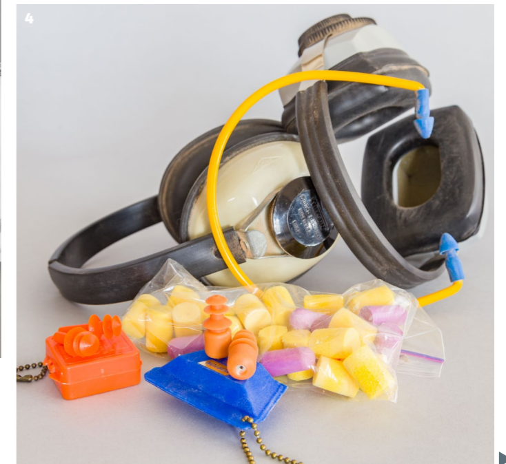
4 I always have room for extra PPE for those onlookers that are only in need of ear protection. Even far away to be safe from debris, is still close enough for too much noise.

“ First and foremost are the safety aspects. Until you've learned the safety aspects and are properly garbed with appropriate PPE, you should be an observer ”