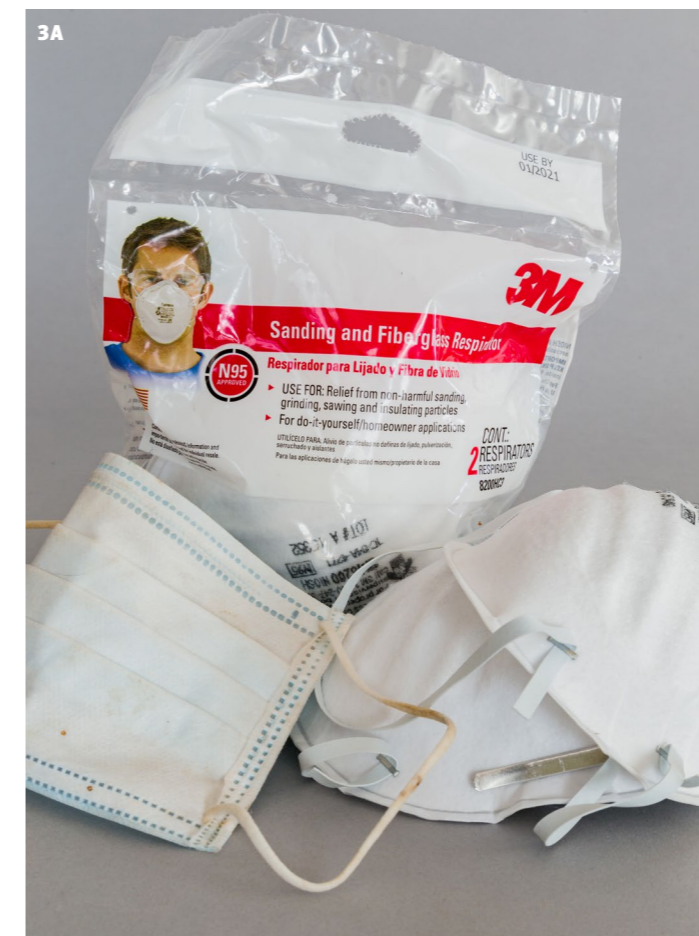
3 There are times when a dust mask is a wise idea. I keep some dust masks in my duffel bag for those occasions. Small, lightweight, and inexpensive protection when needed. 4 I always have room for extra PPE for those onlookers that are only in need of ear protection. Even far away to be safe from debris, is still close enough for too much noise.

comfortable with, but I use a combination hard hat helmet with a wire mesh face mask and integral earmuffs. Along with my head, face, and ear protection, I have a pair of chain saw chaps and jacket, and cut resistant, vibration dampening gloves. It all stores nicely in a duffel bag next to the saw. Some advice wanted or not. Buy for value and not for price if you can swing it. The big box stores are unable to help you with any saw problems. Buying from a dealer who carries the more professional saw products, while pricier, will pay dividends when you have any issues. I have never been unhappy with my local Stihl dealer. That said, I have friends who run professional tree services that use other pro brands and are happy with them. The usable lifetime on my saws is far longer than on me so spending a few extra bucks was worthwhile. Take your time and spend your money to wisely get what fits your needs and has support.