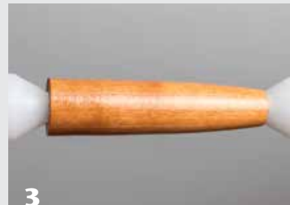
3 If the CA adheres to the pen turning bushings, you might try universal, non-stick, plastic bushings instead.