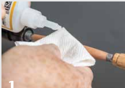
1 Wet a corner of a folded paper towel, without puddling, to prepare for the CA application. Rotating the work by hand, use the wetted towel to "paint" one complete coat on axially, end to end, around once.