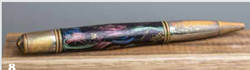
8 This pen is on its second set of metal components, with the original CA finish over the painted body. I’d call that finish tough enough.

have small “builds” of lacquer, and you’ll likely wind up with runs, for which there is no fix, other than to let the finish cure and sand it back enough to spray again.